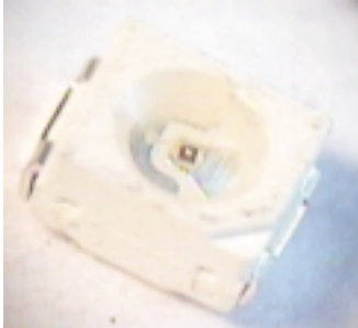
Absolute Maximum Ratings(Ta=25°C)